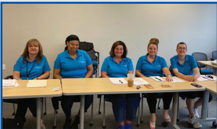
Center Employees Union Executive Board, Trudeau Center

The Assembly budget made several revisions to the existing education funding formula. The budget increases funding for multi-language learners (MLL) by increasing state funding from 10% of cost per MLL student to 15% of cost per student. The formula now reimburses school districts for high-cost special needs students as defined by costs over 4 times per pupil costs instead of the previous definition of 5 times per pupil costs. The revised formula provides two years of increased education funding for districts experiencing enrollment decline and extra funding for districts losing money because of changes in the funding formula. The formula also changes how students in poverty are calculated and revises the formula used to calculate the state share ratio to help poorer communities.